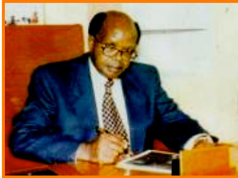
Professor Bethwell Allan Ogot

Project description by Bethwell Allan Ogot, President, International Scientific Committee for the Drafting of a General History of Africa (8 August 1979)